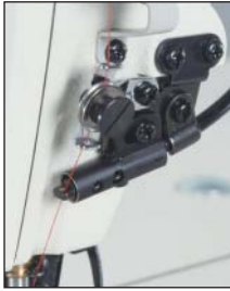
Needle thread draw-out mechanism

The machine comes with a silicon oil lubricating unit, thread spreading mechanism and thread trimming mechanism which trims the thread without fail, thereby consistently ensuring beautifully-finished seams for light- to medium-weight materials. The appearance of the machine is restyled, and it is now colored in a refreshing urban white.