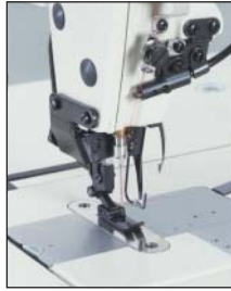
Needle thread clamp mechanism and sliding presser foot